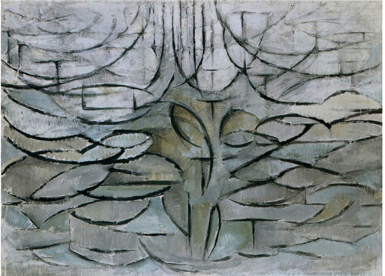
Piet Mondrian, The Flowering of an Apple Tree, 1912