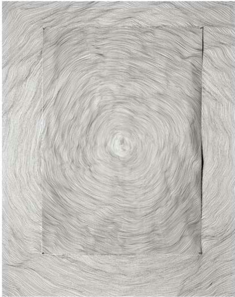
Giuseppe Penone, Propagation, 1997