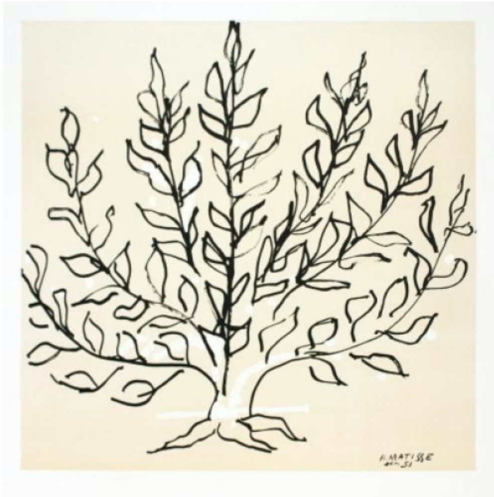
Henri Matisse, Tree, 1951